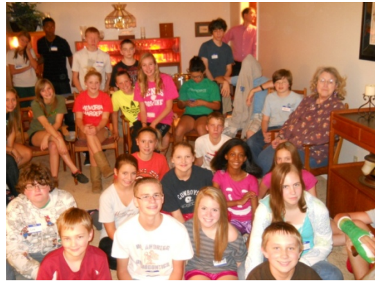
Twenty-Nine Youth at The Parsonage!

"This place is amazing!" cries the rabbi. "You order a baked apple, and look what you get!"